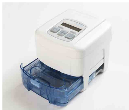
SleepCube with integrated heated humidifier