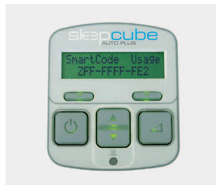
SleepCube with SmartCode display